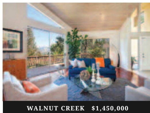
WALNUT CREEK $1,450,000